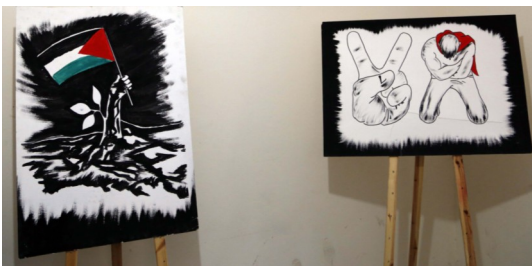
Art pieces from silent exhibition on 22 April 2015.

Dama'ir in Jalazon carried out a silent exhibition and prisoner's day event on 22 April 2015.