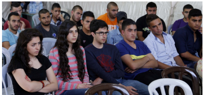
Addameer Training and Awareness Unit carries out "Know your Rights" session in Birzeit on 7 May 2015.