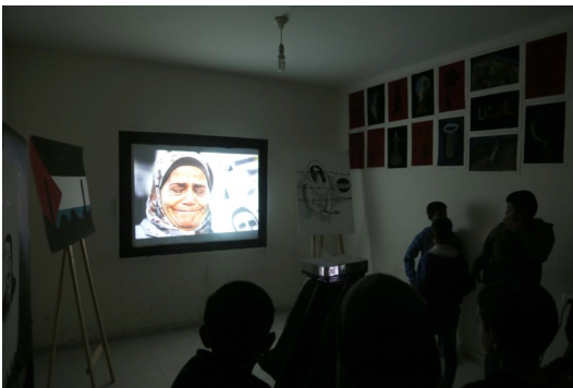
Film Playing by Training and Awareness Unit on 22 April 2015.