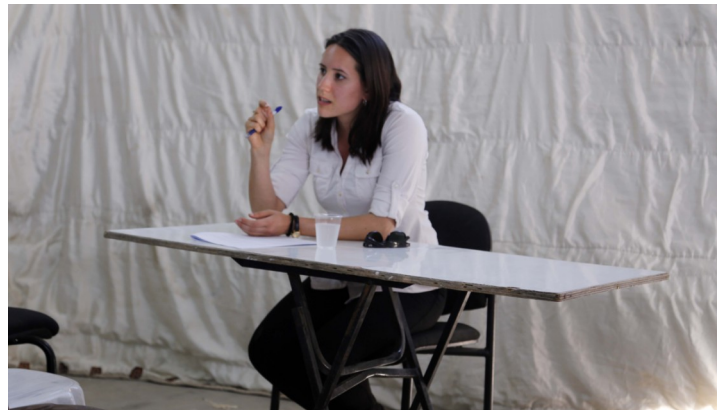
Addameer attorney gives "Know your Rights" lecture on 7 May 2015.

Dama'ir in Jalazon carried out a silent exhibition and prisoner's day event on 22 April 2015.