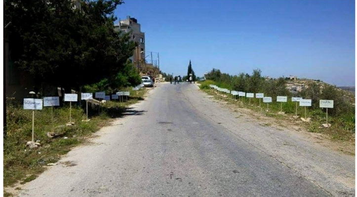
Signs near the entrance of the village with the names of Palestinian political prisoners from the village of Safa.

On 01 May 2015, about 30 Dama'ir Beit Reema and other youth volunteers carried out activity in the event of prisoner's day 2015.