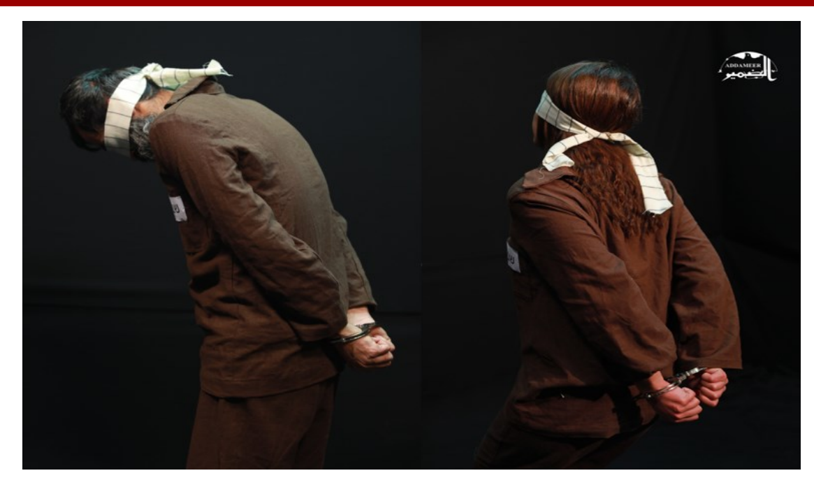
In May 2020, Addameer has documented systematic human rights violations against Palestinian prisoners and detainees, including torture and ill-Treatment.